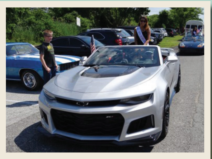
Camaro Fest VII July 13<sup>th</sup>, 14<sup>th</sup> & 15<sup>th</sup>